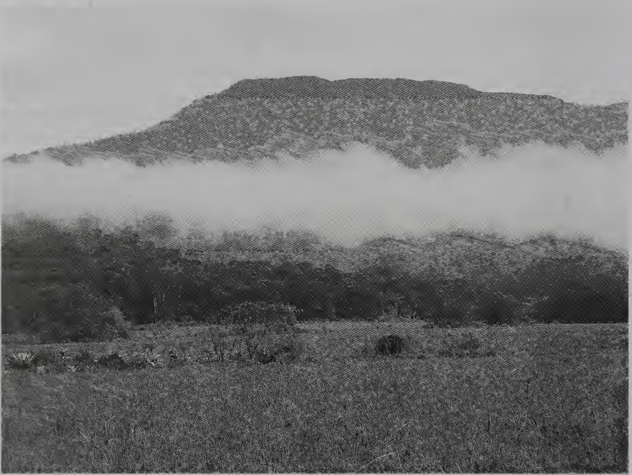
Figure 2. Savanna-forest ecotone near base camp at Kopinang